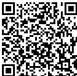
Assembly Constitutional Amendment No. 8