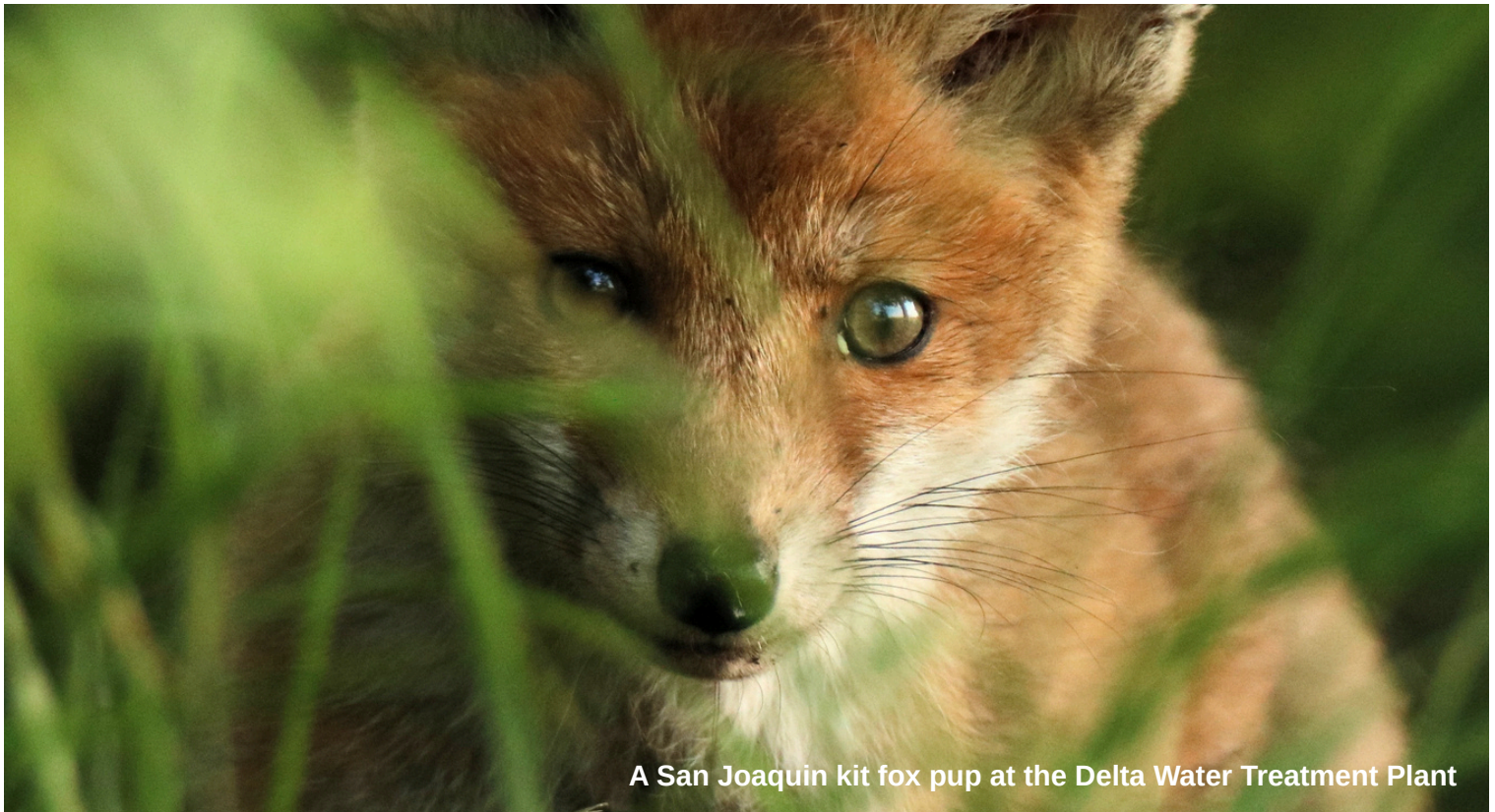
A San Joaquin kit fox pup at the Delta Water Treatment Plant

Drinking Water Source Assessments for the City's water system were completed in 2015 and 2021. The water sources were considered most vulnerable to activities which were associated with contaminants found in the water supply, including urban stormwater, septic tanks and sewage spills, mining, construction, metal plating, electronics manufacturing, National Pollution Discharge Elimination System permitted discharges, dairy waste, and agricultural operations. The water sources were considered most vulnerable to the following activities, which were not associated with contaminants detected in the water supply: illegal activities/dumping, recreation, leaking underground storage tanks, vehicle fueling and maintenance and chemical/petroleum/plastics processing and storage. You may request assessment summaries by contacting Robert Lapp at the State Water Resources Control Board at (209) 948-3816.