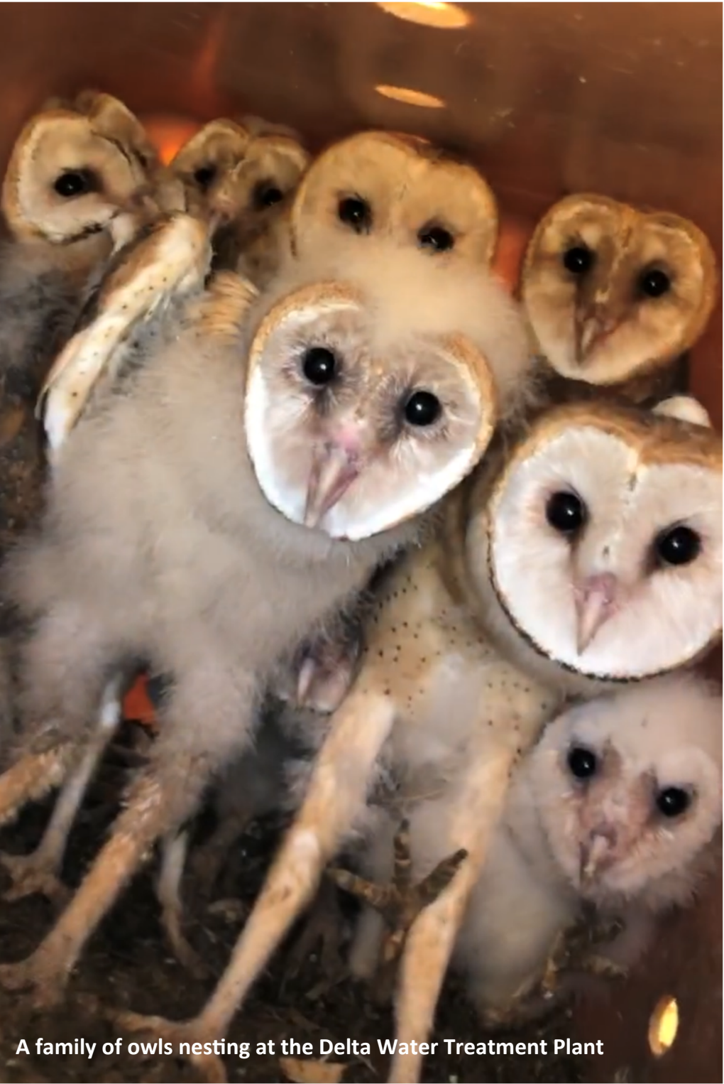
A family of owls nesting at the Delta Water Treatment Plant