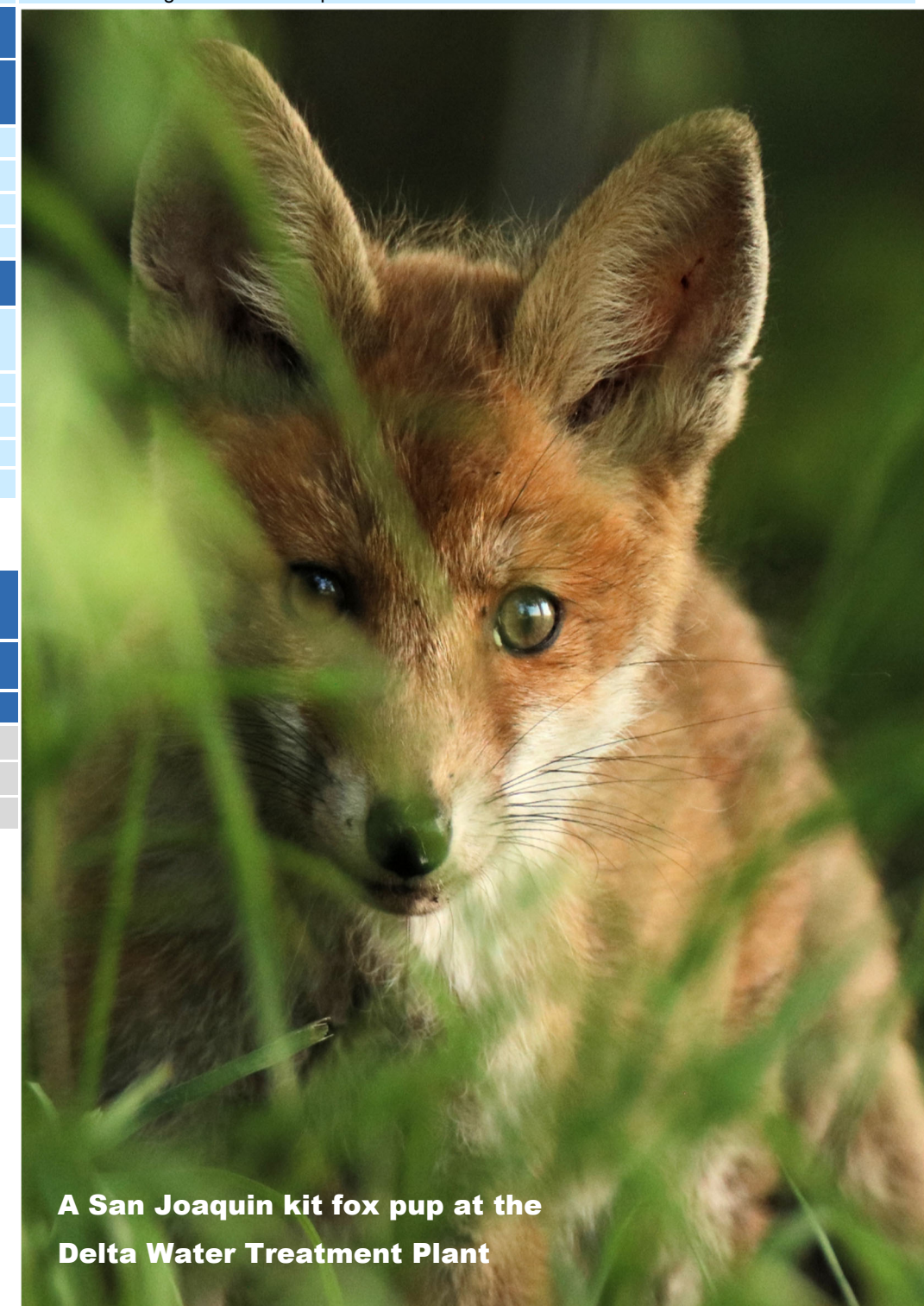
A San Joaquin kit fox pup at the Delta Water Treatment Plant

(4) Per- and polyfluoroalkyl substances (PFAS); 4 monitored by EPA method 537.1.