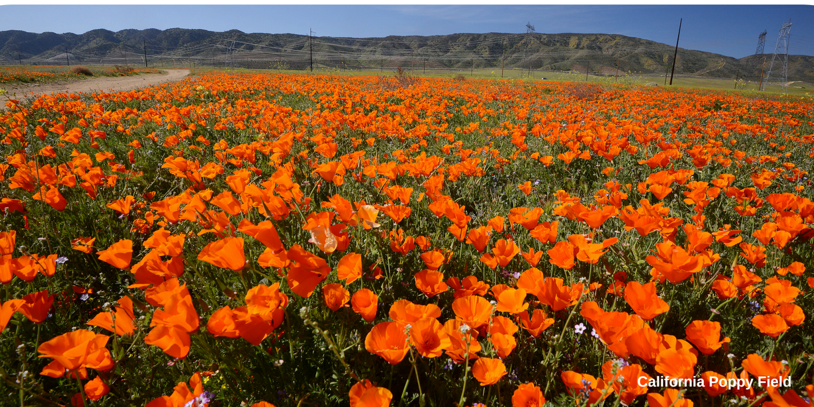
California Poppy Field