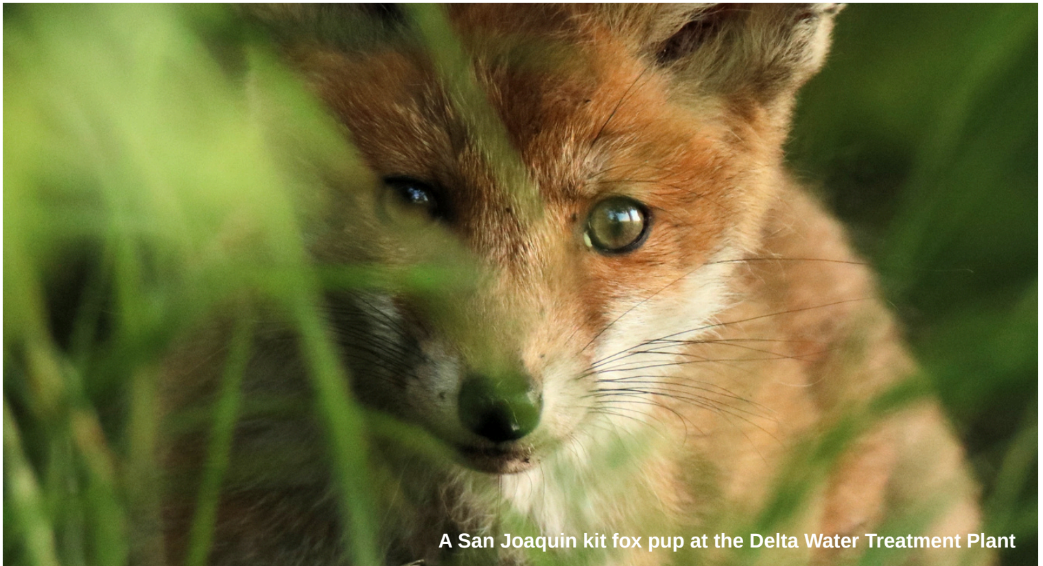
A San Joaquin kit fox pup at the Delta Water Treatment Plant

Drinking Water Source Assessments for the City's water system were completed in 2015 and 2021. The water sources were considered most vulnerable to activities which were associated with contaminants found in the water supply, including urban stormwater, septic tanks and sewage spills, mining, construction, metal plating, electronics manufacturing, National Pollution Discharge Elimination System permitted discharges, dairy waste, and agricultural operations. The water sources were considered most vulnerable to the following activities, which were not associated with contaminants detected in the water supply: illegal activities/dumping, recreation, leaking underground storage tanks, vehicle fueling and maintenance and chemical/petroleum/plastics processing and storage. You may request assessment summaries by contacting Robert Lapp at the State Water Resources Control Board at (209) 948-3816.