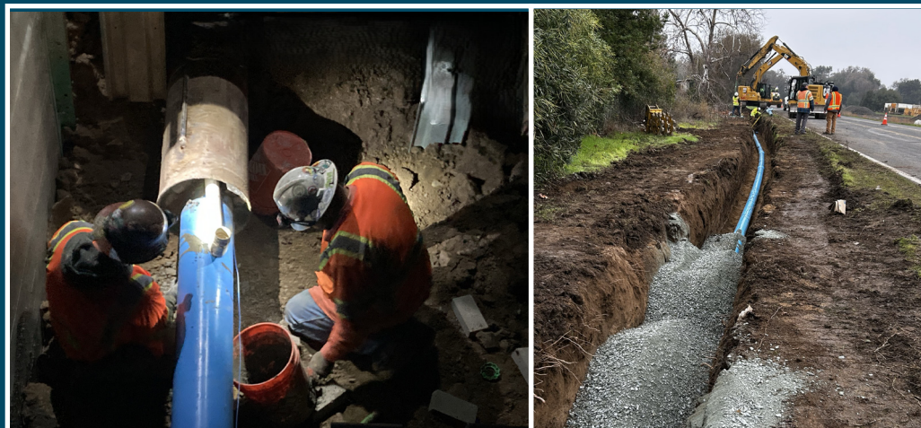
Thornton Water Main Looping