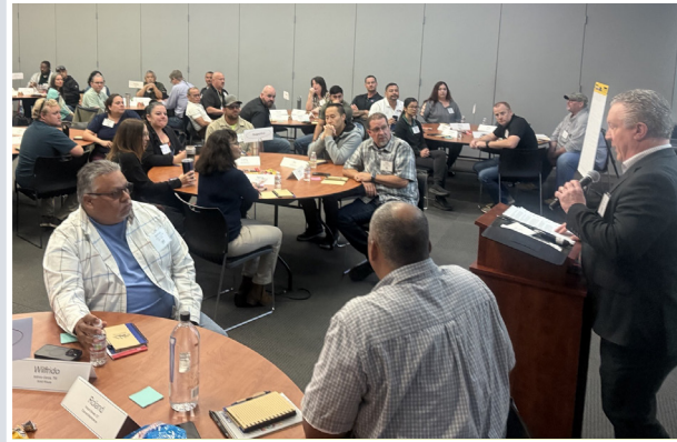
Leadership Development & Team Building

Leadership Development and Team Building – In 2024-2025, Public Works expanded participation in its leadership development and team building program from the approximately 25 highest-level managers to approximately 75 additional managers and supervisors. In addition to training, this group had to identify and prioritize department initiatives to address issues and/or improve service delivery. Plans for 2025-2026 include continued training and work with this expanded leadership team and rolling out an initial training phase to the balance of Public Works staff.