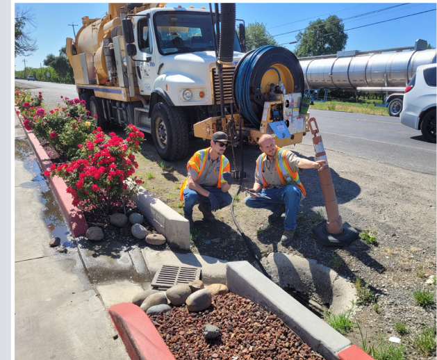
NEXGEN Computerized Maintenance Management System