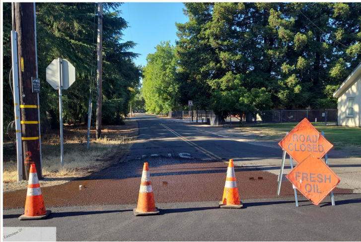
Roadway Slurry Seal