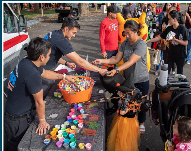
Trunk Or Treat Event For Families