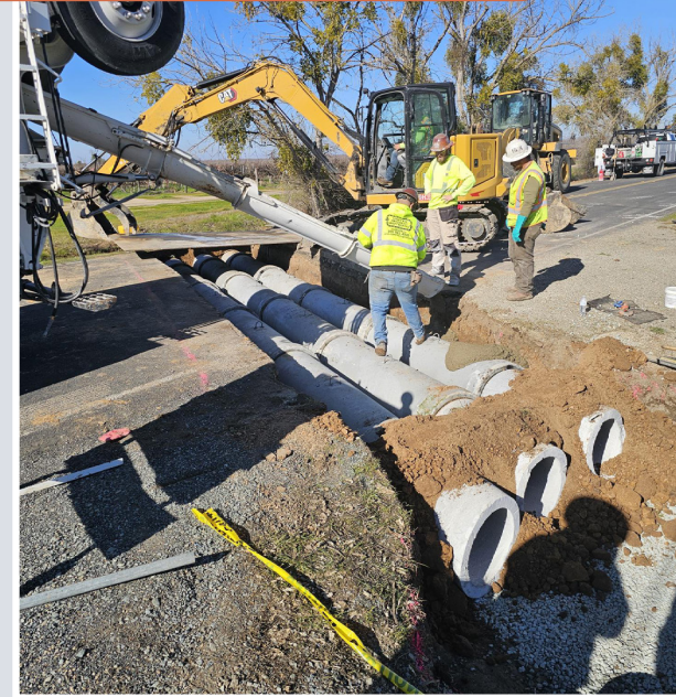
Fine Road Drainage Improvements

Completed Ice Pigging for Thornton Residents , which improved water quality in the Thornton community. Using an advanced pipeline cleaning technique that utilizes a slurry of ice and liquid to scour the inside of nearly 5 miles of water pipes in Thornton. It removed sediment and other deposits that build up over time.