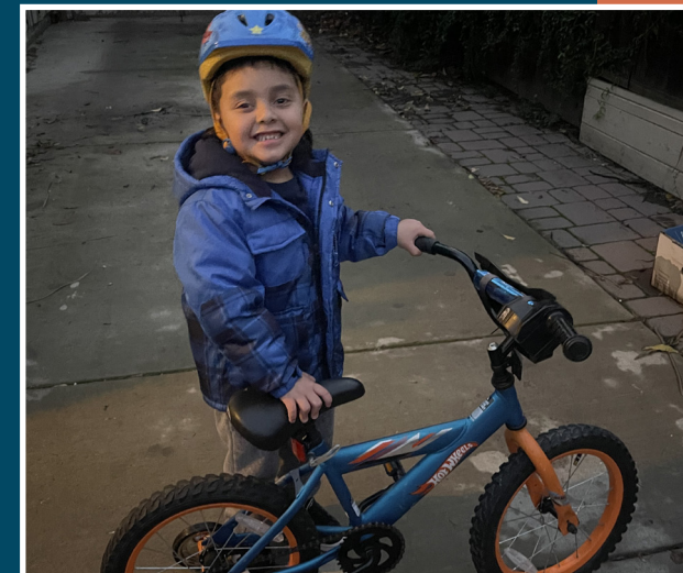
Public Works Recycle Program