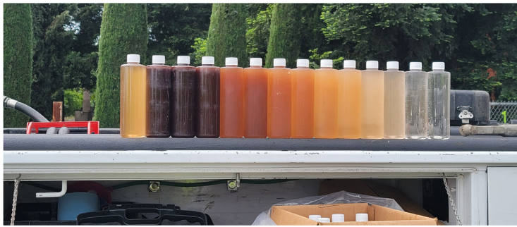
Ice Pigging Water Quality Process for Thornton Residents

Completed the Fine Road Drainage Improvements Project , which reduced flood risks east of Fine Road between Milton Road and Dynasty Drive. The project added three culverts under Fine Road at Dynasty Drive and performed ditch grading improvements to reduce localized flooding in this rural residential area by allowing runoff to flow more efficiently downstream.