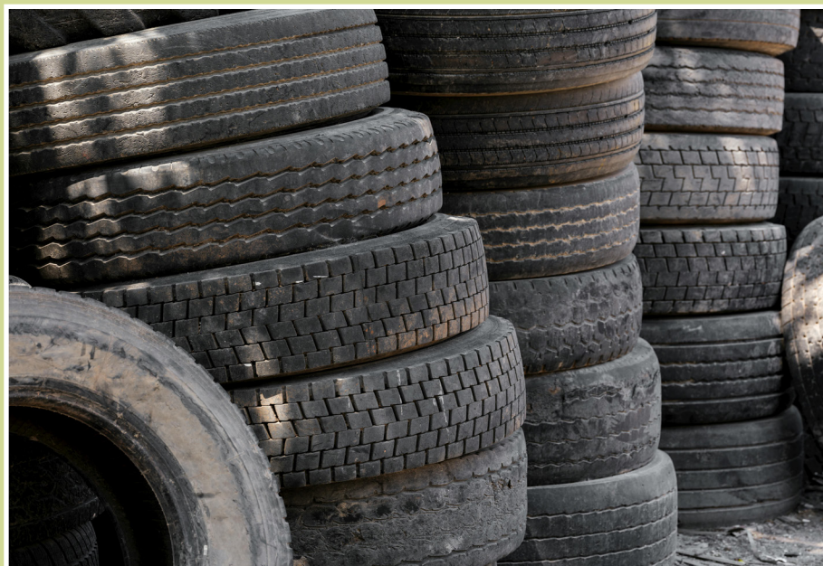
One Million Pounds of Tires Recycled