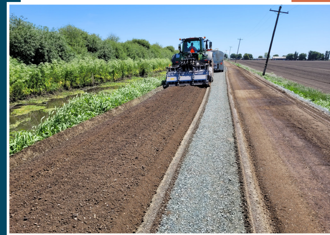
Sustainable Road Stabilization on Woodbridge Road