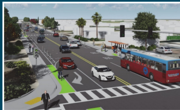
Kennedy Community Complete Streets Plan