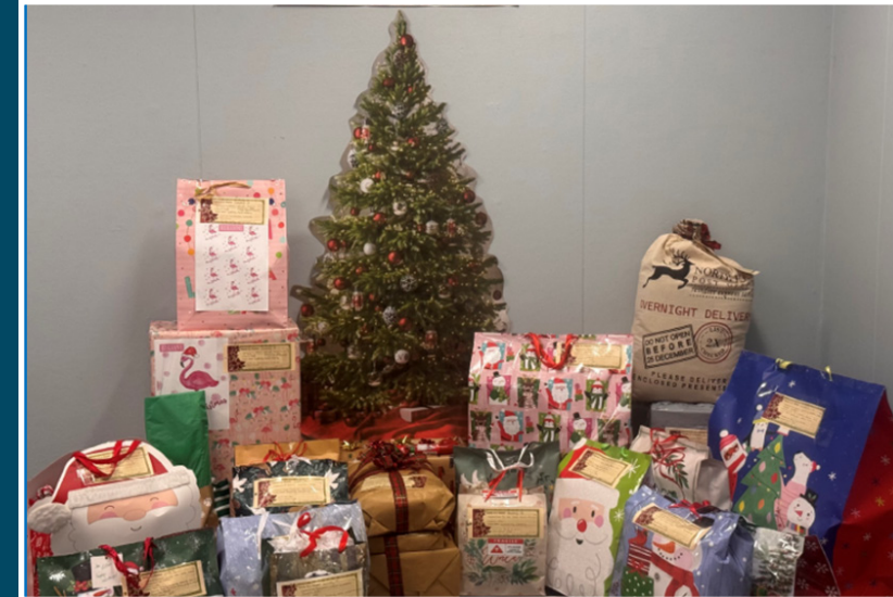
Santa for Seniors

Public Works continued its Recycle Program through which the Solid Waste team volunteers their time and skills to repair, reuse, and repurpose discarded bicycles and donates them to the community to benefit youth in need. This year, the team restored 86 bicycles, and recipient organizations included the Child Abuse Prevention Council, Brighter Christmas Charity Organization, Thornton Community Center, Kennedy Community Center, and several Boys and Girls Clubs throughout the County.