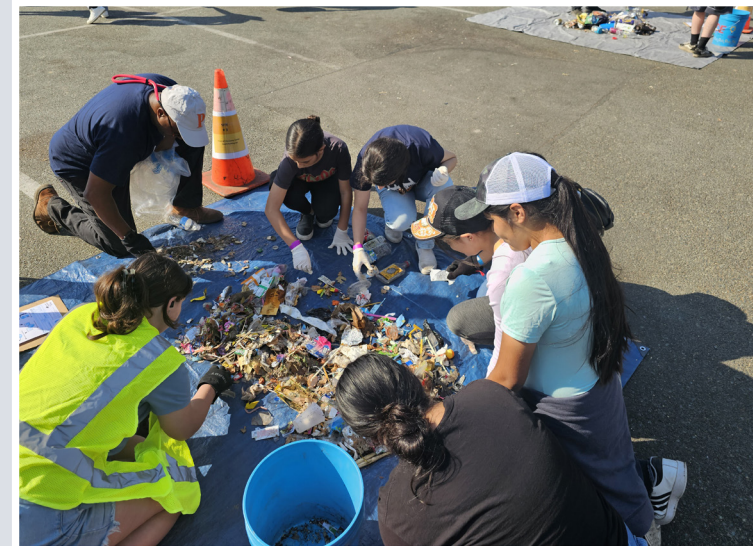
25th Annual Coastal Cleanup Day

Submitted the Updated Eastern San Joaquin Groundwater Subbasin Groundwater Sustainability Plan (GSP) The Groundwater Authority, consisting of 16 groundwater sustainability agencies (including San Joaquin County), submitted a 5-year update to the Eastern San Joaquin Groundwater Sustainability Plan (GSP) to the California Department of Water Resources. The updated GSP, required under the 2014 Sustainable Groundwater Management Act (SGMA), outlines projects and actions to ensure the subbasin reaches sustainable groundwater use by 2040.