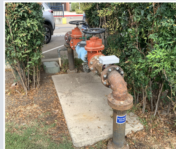
Advanced Metering Infrastructure

Developed a Roadway and Pavement Preservation Story Map to enhance transparency and customer service. This digital platform serves as a dynamic presentation tool where the central feature is an interactive map. The developed roadway-focused story map provides the public with an overview of our transportation network, various revenue sources and