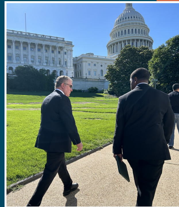
Washington, D.C. Advocacy Trip