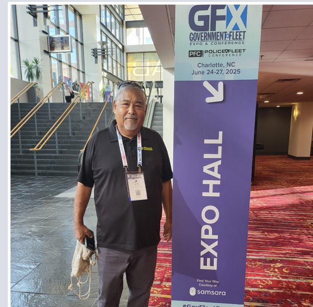
Investing in Public Works Employees