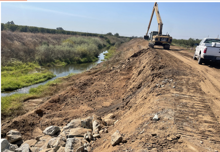
Clearing Channels at Mormon Slough