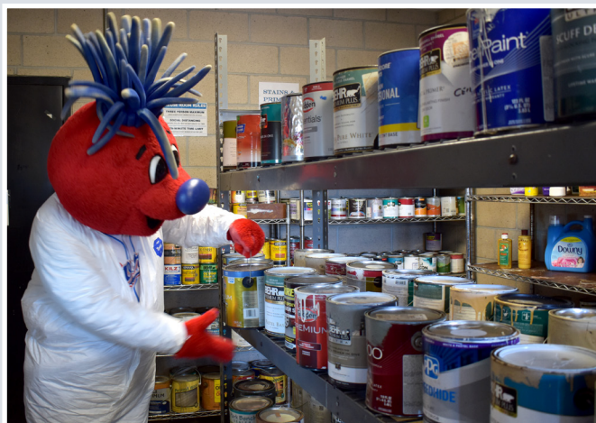
Reuse Room Program

Completed Advanced Metering Infrastructure in Colonial Heights and Lincoln Village , which allows water meters to be read and operated remotely. The improvements increase water management efficiency by enhancing data and leak detection capabilities, reducing operational costs for the districts, and providing residents with greater awareness and control over their water consumption.