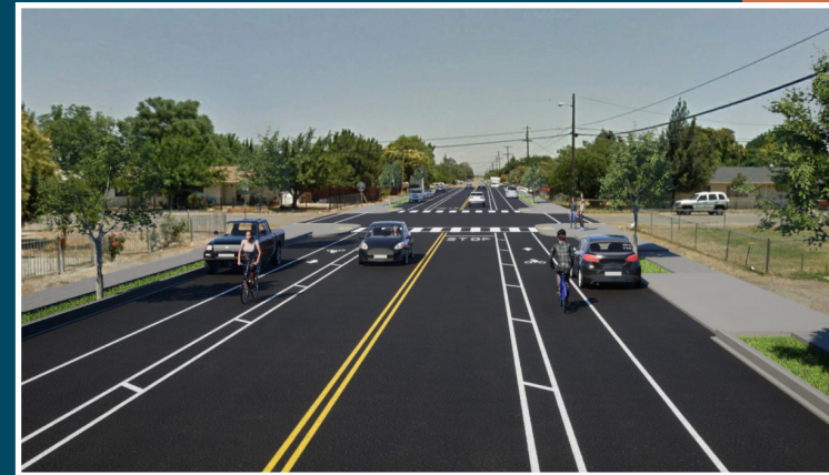
Garden Acres Sustainable Communities Plan