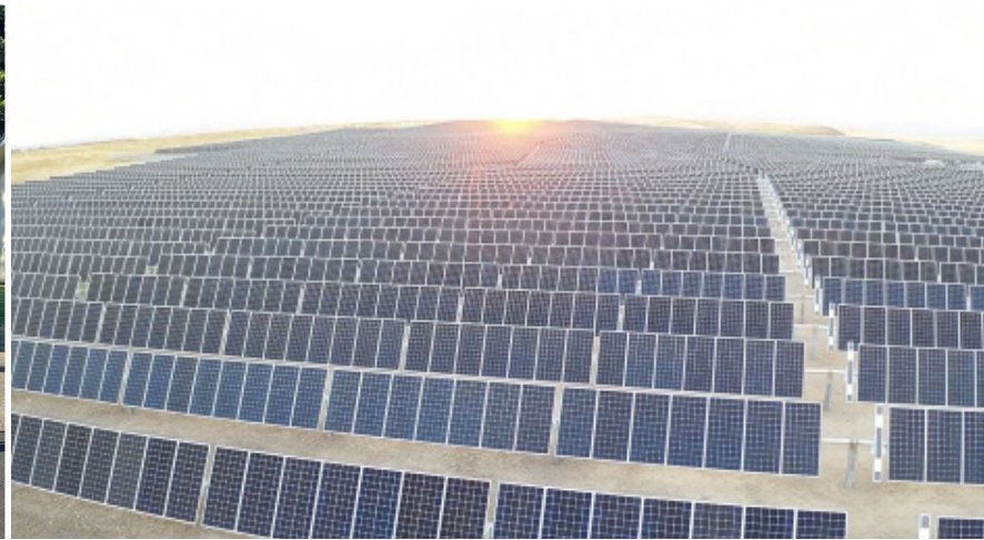
30,034 Kilowatts of Solar Energy Generated From Landfill