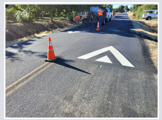
Speed Cushion Installation