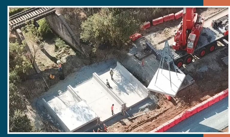
Kennefick Road Flood Control Project