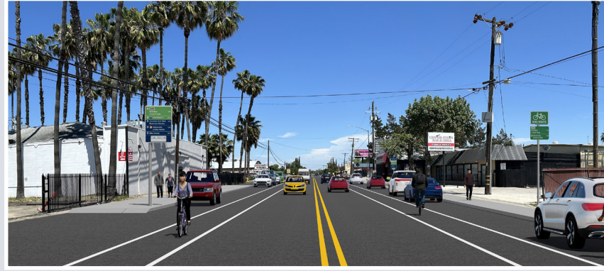
Country Club Boulevard Complete Streets Corridor Plan