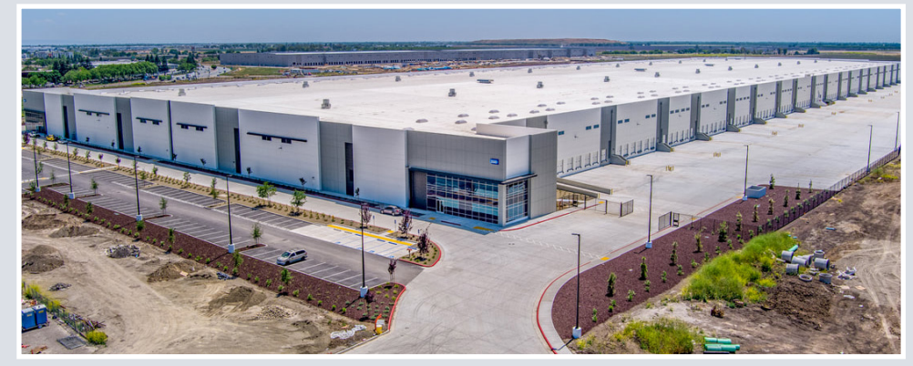
Airpark 599 Buildout