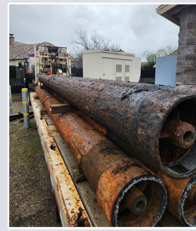
ARPA-Funded Well Improvements Project: Before