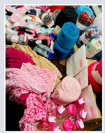
Cancer Patient Donations