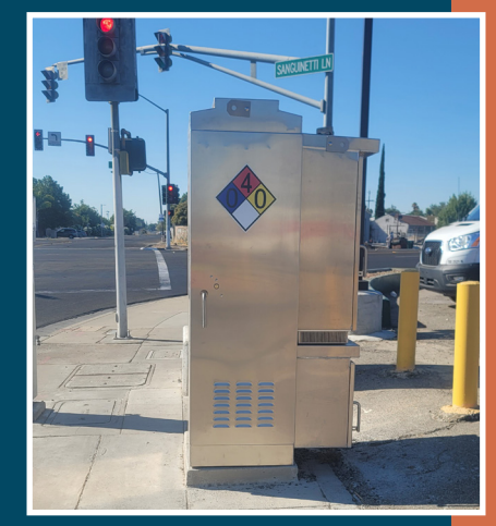
Hydrogen Backup Power System