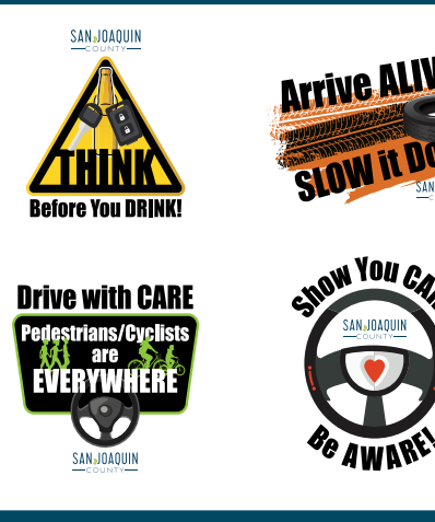
Digital Safety Campaign