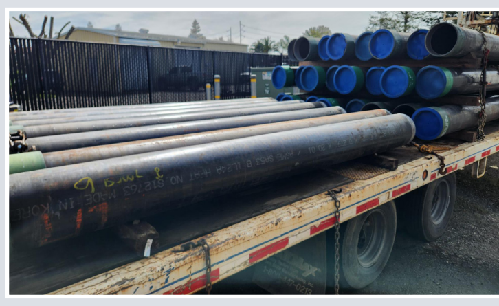
ARPA-Funded Well Improvements Project: After