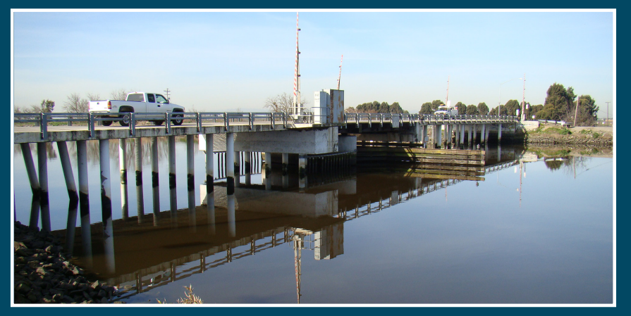
Movable Span Bridge Repairs