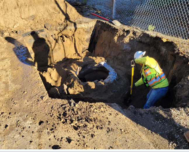
Pacific Gardens Sanitary District Sewer Project

1,045 encroachment permits processed and inspected