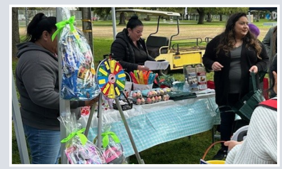
Micke Grove Easter Egg Hunt