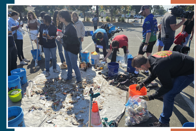
23rd Annual Coastal Cleanup Day