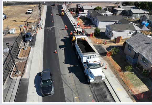
Oro and Section Sidewalks Project