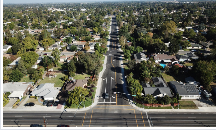
Pershing Avenue Improvements