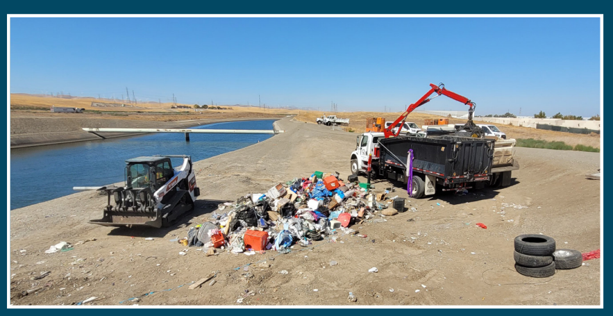
Public Works Illegal Dumping Waste Removal