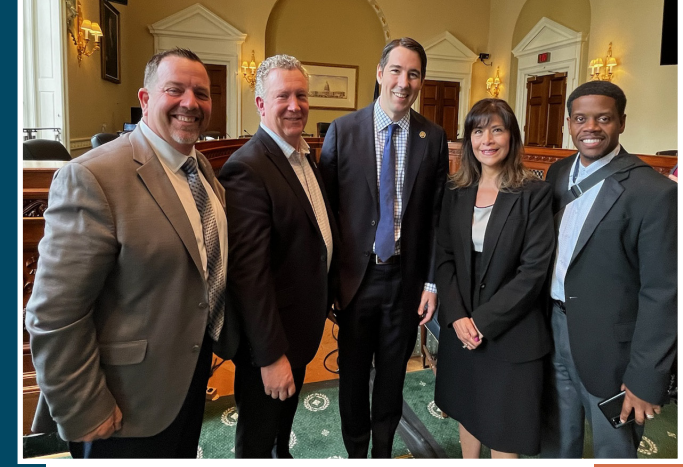
One Voice Advocacy Trip to Washington D.C.