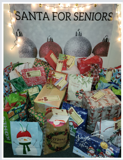
Santa For Seniors Gift Program