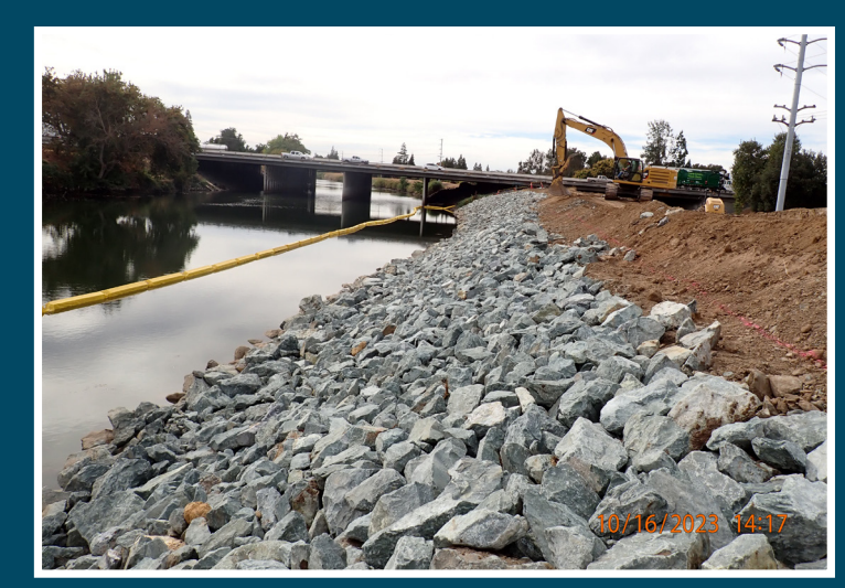
Calaveras River Erosion Control Project