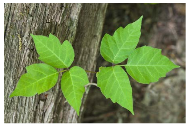
Figure 1 Poison Ivy