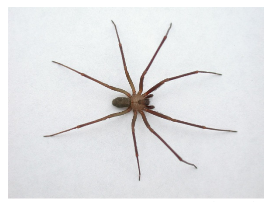
Figure 4 Brown Recluse Spider