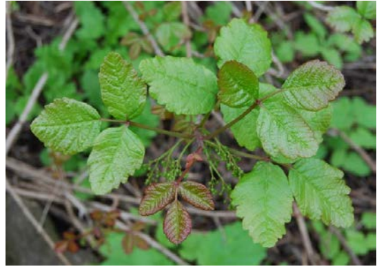
Figure 2 Poison Oak