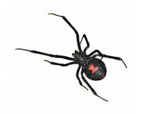
Figure 3 Black Widow Spider