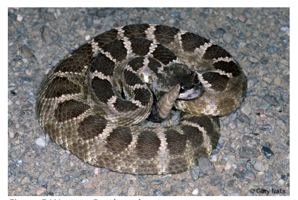
Figure 5 Western Rattlesnake