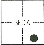
C.M. WEBER GRANT