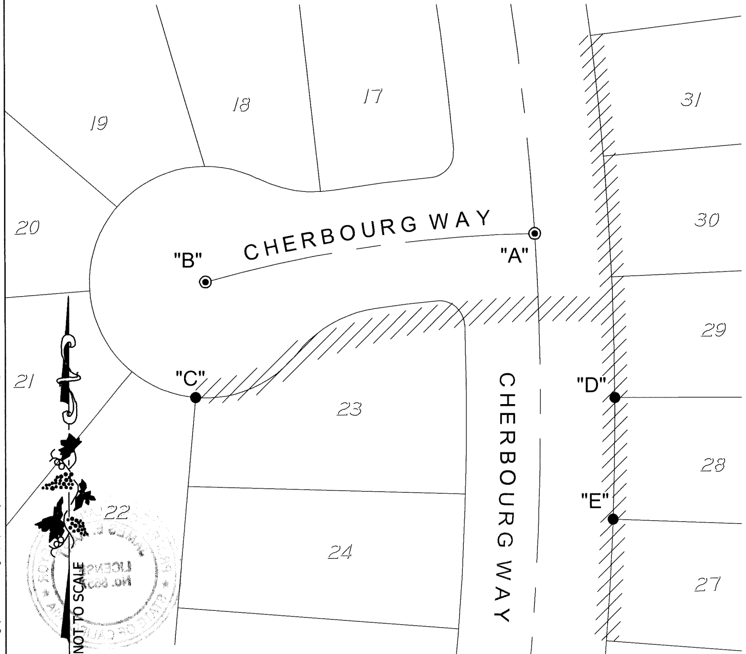
ANGLE AND DISTANCE TABLE

THIS CORNER RECORD IS FOR THE PURPOSE OF MONUMENT PRESERVATION. REFERENCES WERE SET FOR FOUND MONUMENTS AS NOTED ON DIAGRAM. NO BOUNDARY ANALYSIS WAS PERFORMED. THIS CORNER RECORD DOES NOT VERIFY THE MONUMENT(S) TO BE IN THE CORRECT POSITION.