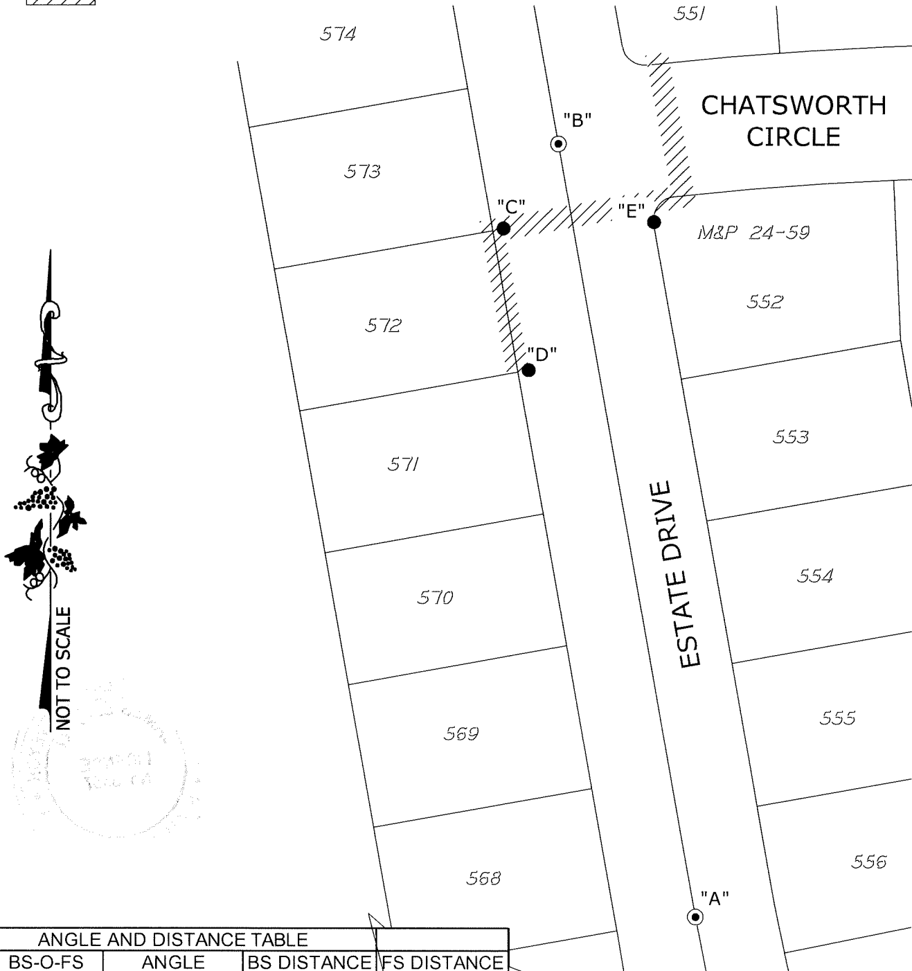
ANGLE AND DISTANCE TABLE

THIS CORNER RECORD IS FOR THE PURPOSE OF MONUMENT PRESERVATION. REFERENCES WERE FOUND AND/OR SET FOR FOUND MONUMENTS AS NOTED ON DIAGRAM. NO BOUNDARY ANALYSIS WAS PERFORMED. THIS CORNER RECORD DOES NOT VERIFY THE MONUMENT(S) TO BE IN THE CORRECT POSITION.