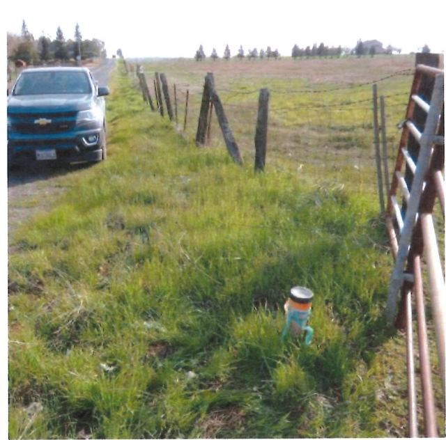
Westerly right-of-way of Mackville Road at intersection with Coyote Creek Lane.