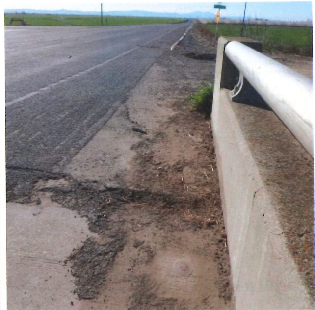
Northwesterly corner of the Howard Road Bridge across Middle River.