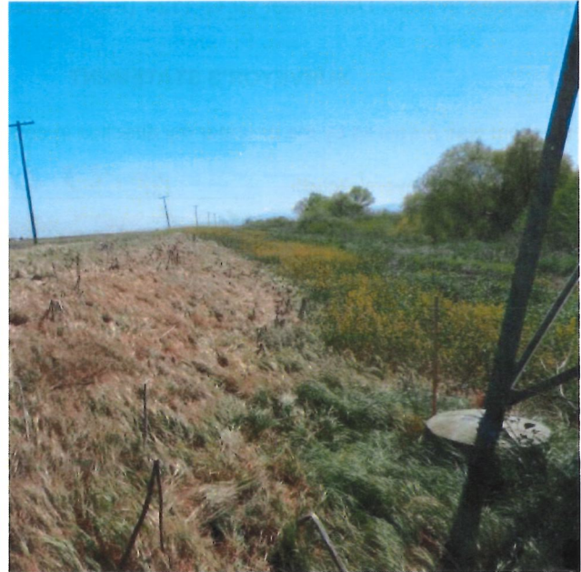
The Most Easterly leg of the Electrical Transmission Tower along the Westerly right-of-way line of Tracy Boulevard. Approximately 6,030 feet Northerly from the Howard Road Intersection.