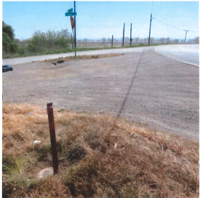
Southerly right-of-way of Cook Road. Approximately 100' Northeasterly from the Trapper Road Intersection.