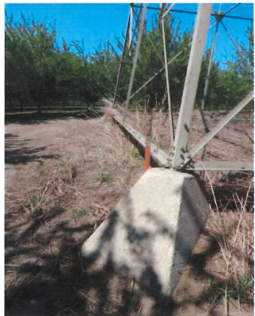
The Most Southerly leg of Easterly Electrical Transmission Tower along the Northerly right-of-way line of State Highway Route No. 4. Approximately 4,825 feet West from the Inland Drive Intersection.