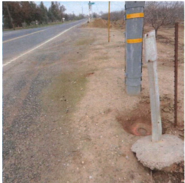
Along the Southeasterly right-of-way of Durham Ferry Road, approximately 90' Southwesterly from the Northerly Kasson Road Intersection.