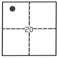
CAMPO DE LOS FRANCESES

Brief Legal Description MONUMENTS AT THE INTERSECTION OF EAST FREMONT STREET AND NORTH HUNTER STREET.