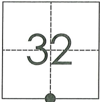
T5N R8E MDB&M

City of _____ County of San Joaquin , California Brief Legal Description Liberty Road 2668± east of Dry Creek Road