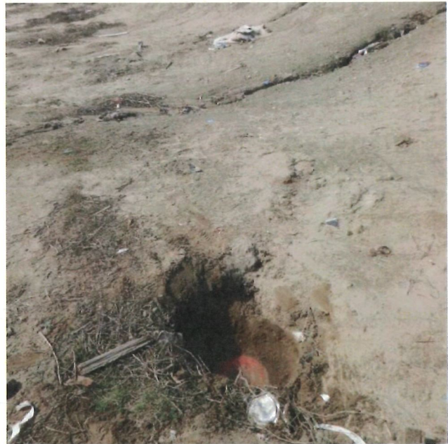
Northeasterly of D'Arcy Parkway, Southeasterly of South Howland Road and Northwesterly of Union Pacific Railroad tracks.