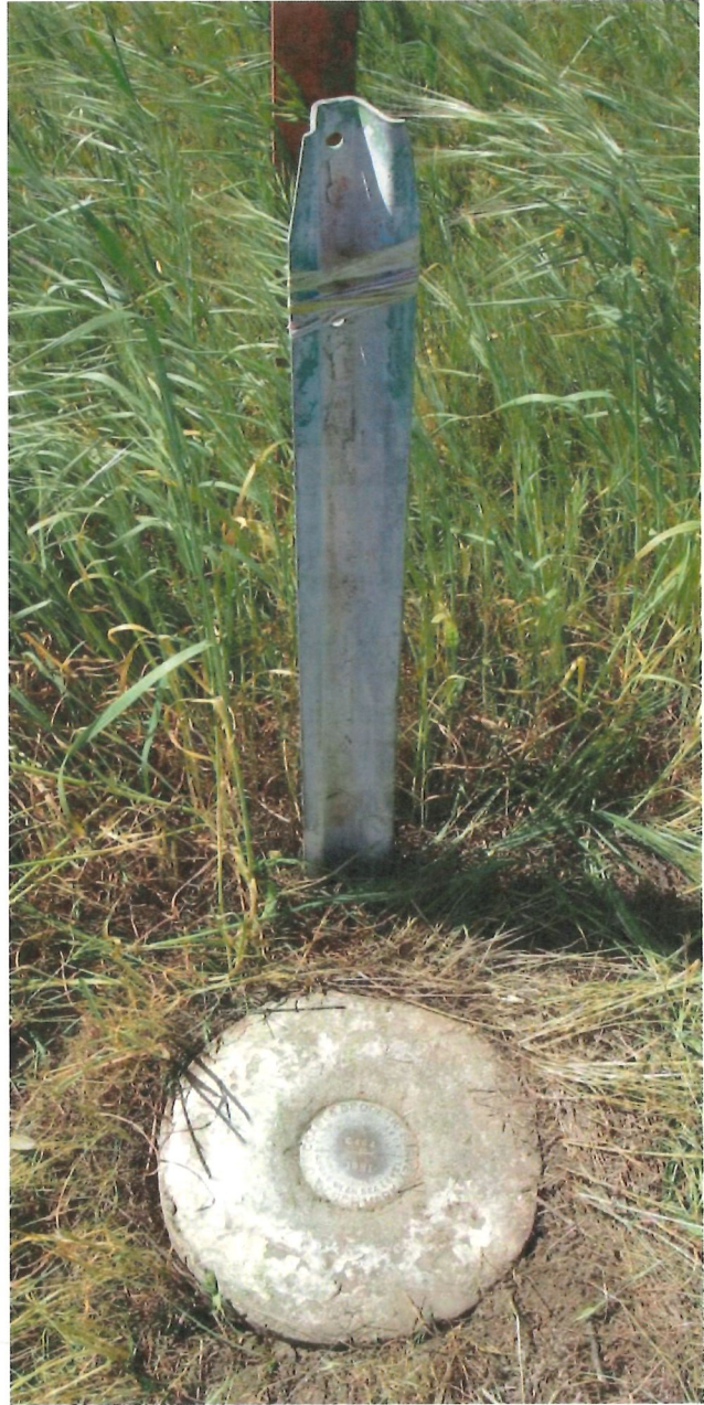
Between Interstate Highway Route No. 5 and West of Thornton Road about 4,900' South along Thornton Road from the Intersection of Turner Road .