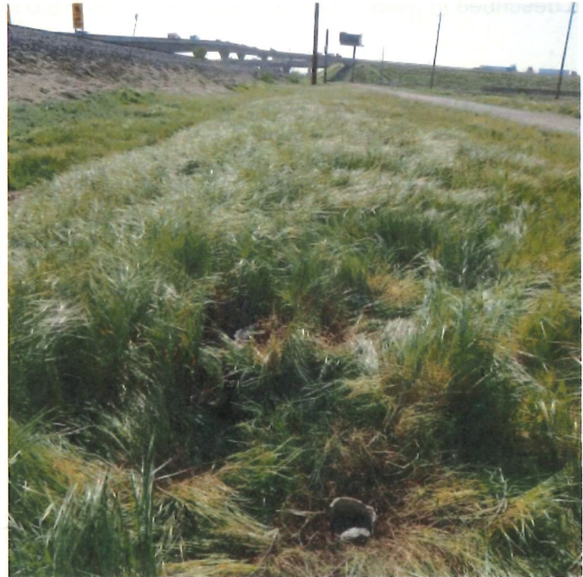
Northerly of Union Pacific Railroad tracks, approximately 5,500' southwesterly along the Union Pacific Railroad tracks from the intersection of D'Arcy Parkway.