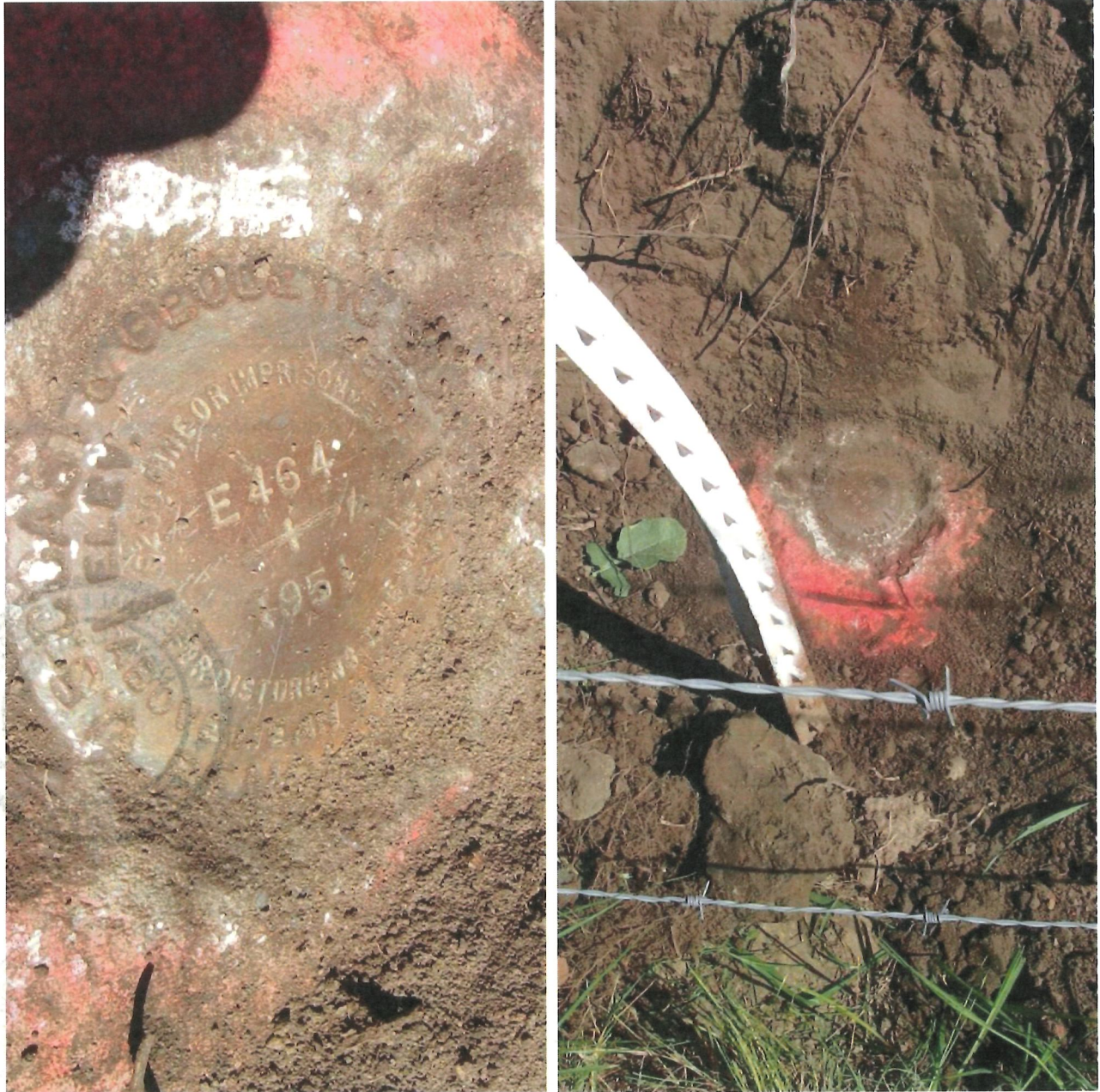
Southeast corner of the intersection of State Highway Route No. 12 and Guard Road. Approximately 220' South along Guard Road.