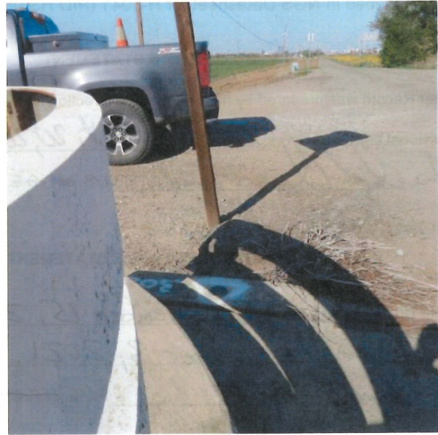
Northeasterly end of Manthey Road Bridge across Paradise Cut.