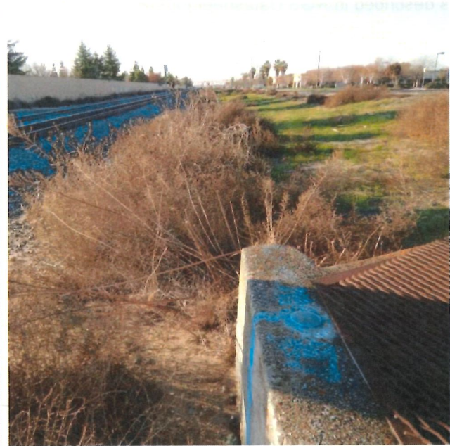
Northwesterly corner of S.S.J.I.D. Box located between the Union Pacific Railroad tracks and Moffat Boulevard. Approximately 2,220' Northwesterly along Moffat Boulevard from the intersection of Woodward Avenue.