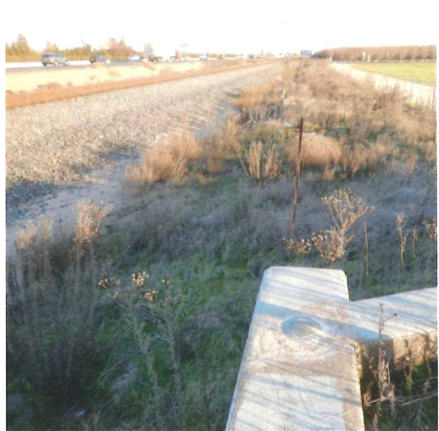
Northeasterly corner of a concrete headwall Southwesterly of the Union Pacific Railroad tracks. Approximately 430' Northwesterly along the Union Pacific Railroad tracks from Olive Avenue.