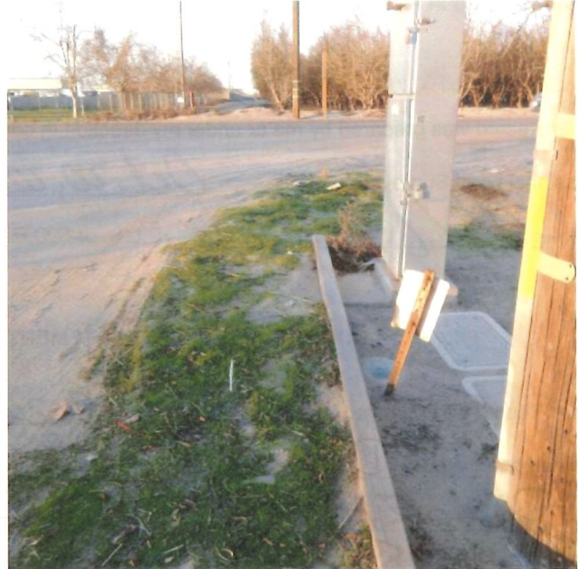
Southeast corner of the intersection of State Highway Route No. 120 and Calla Drive.