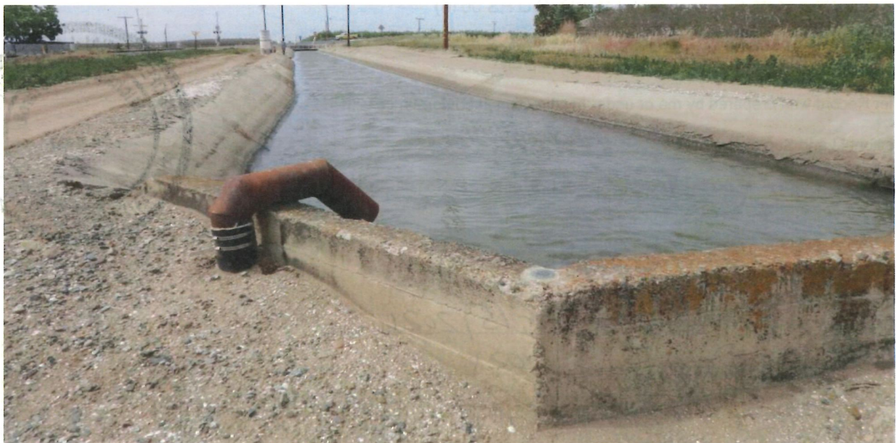
Most Southerly corner of the Northerly B.C.I.D. concrete headwall. Approximately 520' Southeasterly along the B.C.I.D. Canal from the intersection of Bird Road.