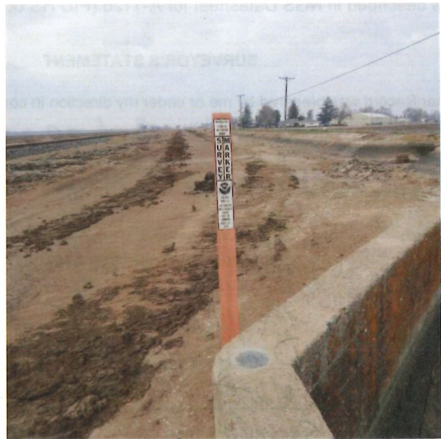
Northwesterly corner of the Easterly B.C.I.D. concrete headwall from the Union Pacific Railroad tracks. Approximately 2,600' Northwesterly along the Ahern Road from the intersection of Lehman Road.