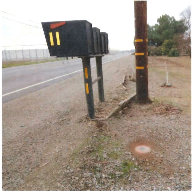
Approximately at the North right-of-way of Durham Ferry Road at the Southwesterly corner of Parcel "A" per P.M. 5-71.