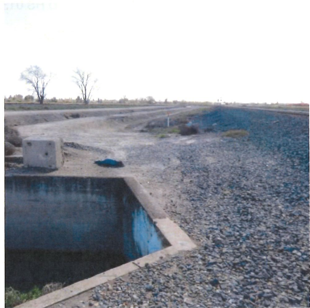
Southwesterly corner of a concrete drain ditch headwall, being North of the Union Pacific Railroad tracks and located in the East Half of Section 25, T.1S., R.6E., M.D.B. & M.