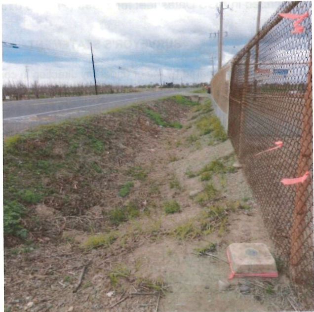
About 1,930'± Westerly along Walnut Grove Road from the Walnut Grove Road and Vail Road Intersection and located along the Northern right-of-way.