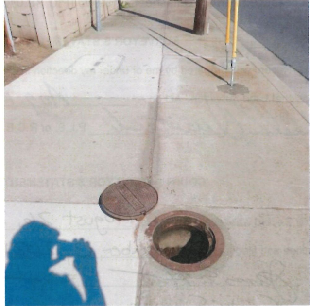
Northwest corner of intersection of the Union Road and Union Pacific Railroad crossing.