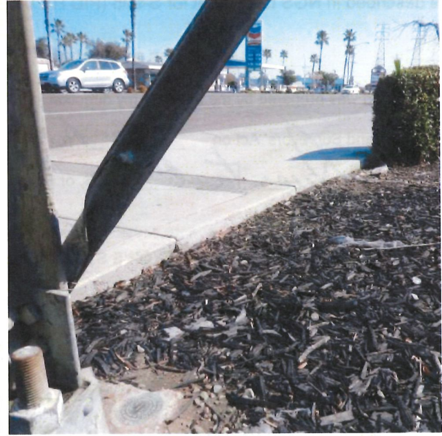
The most Northerly Electric Transmission Tower leg along the Southerly right-of-way of Yosemite Avenue and about 630'± Westerly from the Yosemite Avenue and Union Road intersection.