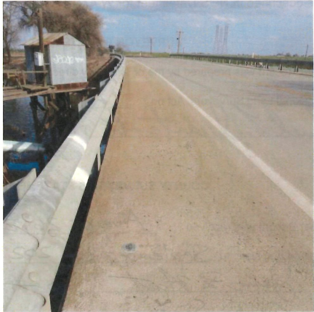
Northwest corner of the Undine Road Bridge across Middle River