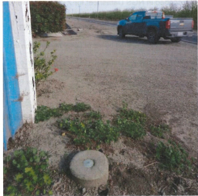
Near the Southeast corner of Parcel "1" as shown on P.M. 19-182, S.J.C.R. along the Northerly right-of-way of Undine Road.