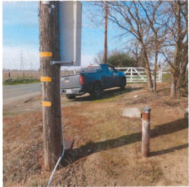
Northeast corner of intersection of Elliott Road and Liberty Road.