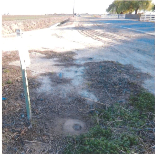
Near the Southwest corner of Section 21, T.1N., R.6E., M.D.B.&M. along the Easterly right-of-way of Roberts Road.