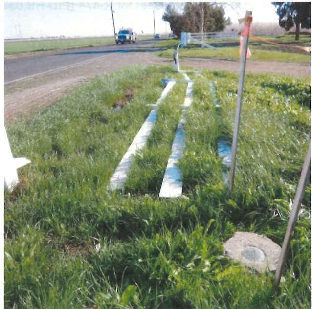
About 3,840'± North along Roberts Road from the Roberts Road and Howard Road Intersection and located along the Western right-of-way.