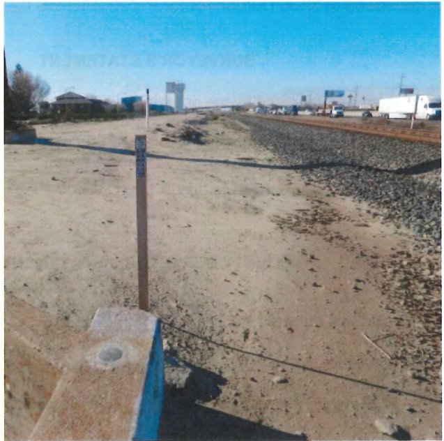
Northerly end of concrete Irrigation Canal Headwall Southwest of the Union Pacific Railroad road and just north of the Fulton Avenue Bridge over Hwy 99.