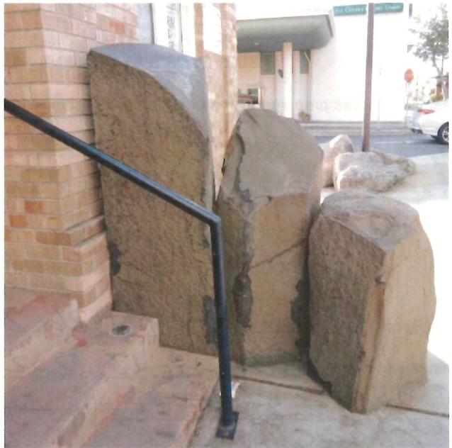
Northerly end of stairs at the Mc Fall Grisham Post No. 249 Building