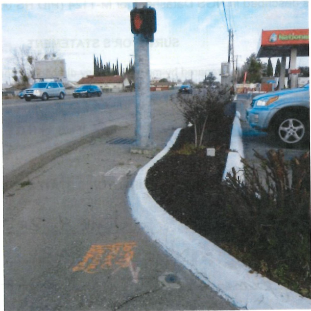
Southeast corner of intersection of Airport Way and Yosemite Avenue