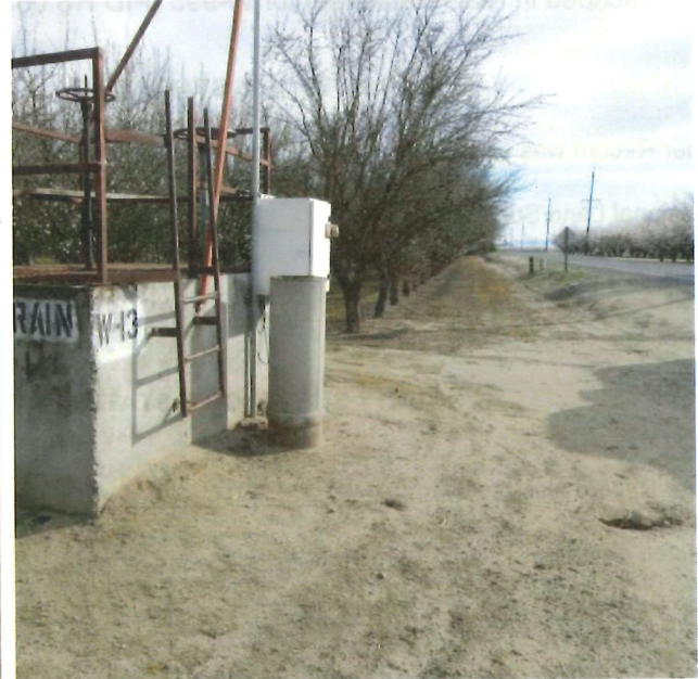
East side of Airport Way, South of Nile Avenue