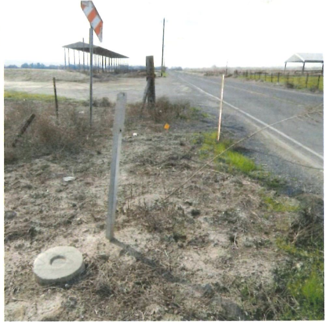
Southwest corner of the intersection of Airport Way and Mortensen Road