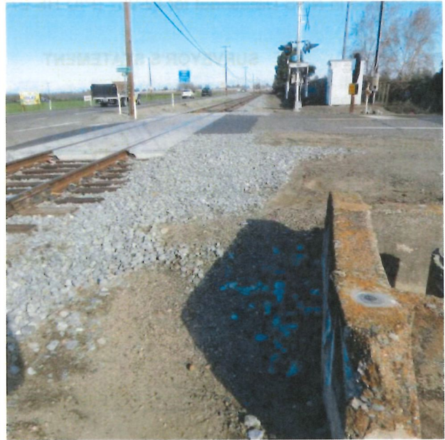
Southwest of intersection of Highway 120 and Brennan Avenue