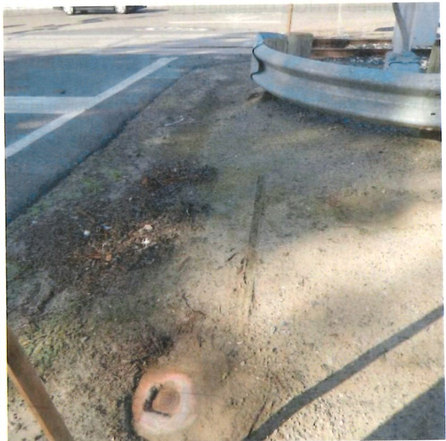
South Southeast of intersection of State Highway 120 and Carrolton Road