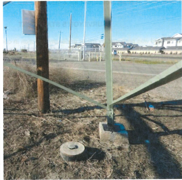
South side of Von Sosten Road West of Byron Road