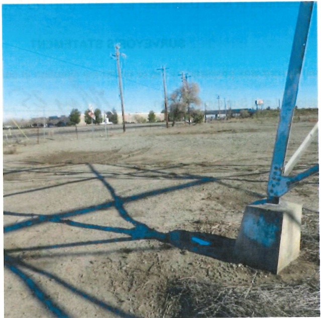
South side of Von Sosten Road West of Byron Road