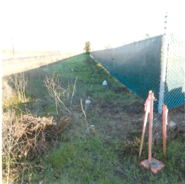
Near the Southeast corner of Mariposa Road and Murphy Road