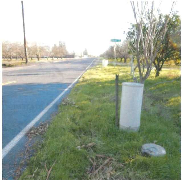
Northwest of intersection of Murphy Road and Louise Avenue