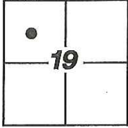
C.M. WEBER GRANT

Brief Legal Description FOUND MONUMENT AT THE INTERSECTION OF N. EL DORADO STREET AND E. HARDING WAY LOCATED IN THE NORTH HALF OF SECTION 19, C.M. WEBER GRANT.